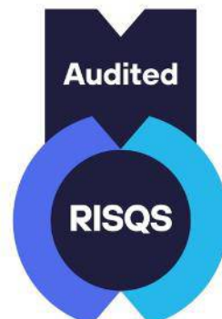
RISQS Scheme Manager